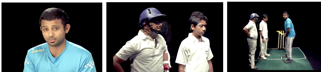
Cricket coaching on KidsHubTV India

It is hoped that as a result of seeing KidsHub videos children would be encouraged to participate in a local KidsHub or church group and/or visit the KidsHubTV website. And a church wanting to grow their children's ministry in a region (like India) where the show is screening, could download Bible lessons written to complement each episode, and benefit from the momentum of the show.